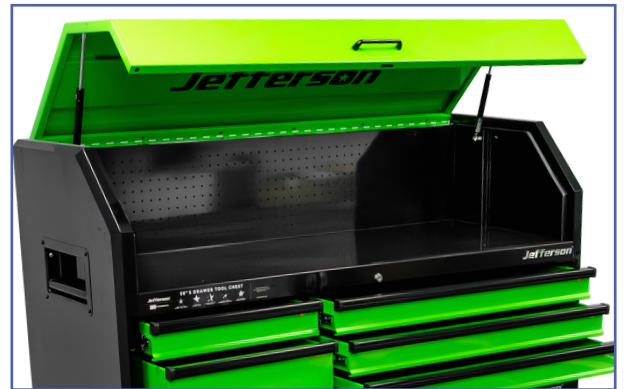
GAS STRUTS ON THE TOP LID PROVIDES SMOOTH AND EFFORTLESS OPENING/CLOSING