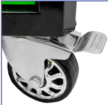
HEAVY-DUTY CASTOR WHEELS 4X SWIVEL (2 WITH BRAKE) & 2X FIXED