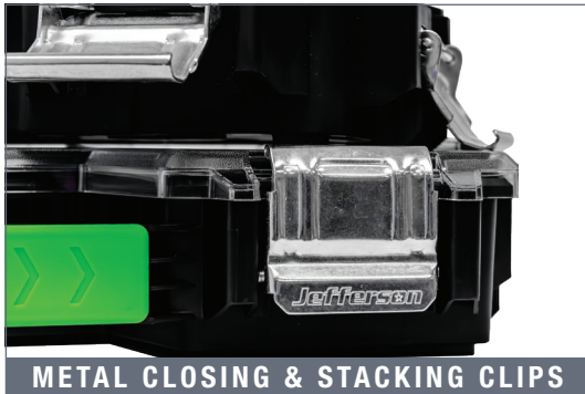
METAL CLOSING & STACKING CLIPS