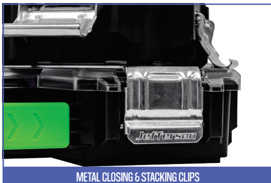
METAL CLOSING & STACKING CLIPS