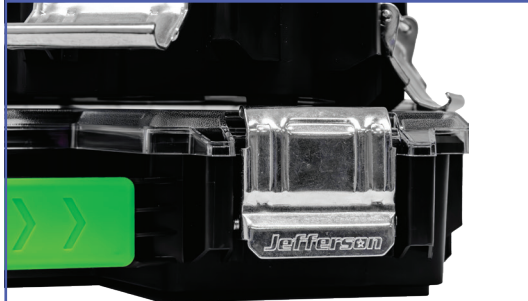
METAL CLOSING & STACKING CLIPS