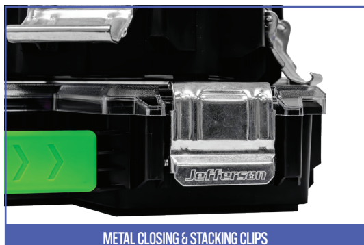
METAL CLOSING & STACKING CLIPS