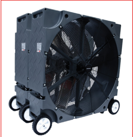
OVERLAY DESIGN ALLOWING UNITS TO BE CONNECTED FOR INCREASED AIRFLOW