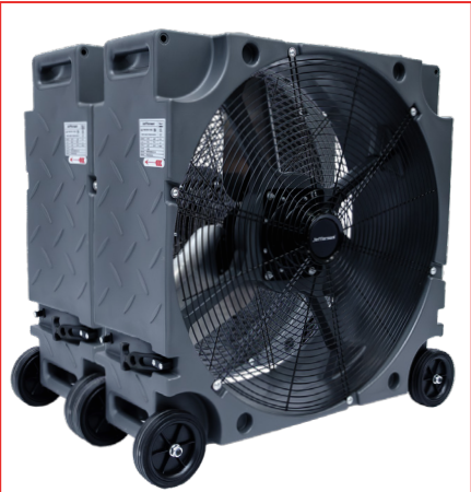
OVERLAY DESIGN ALLOWING UNITS TO BE CONNECTED FOR INCREASED AIRFLOW