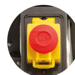
Emergency power off switch

See also: The Jefferson range of Drill Chucks & Adaptors