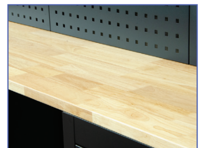
Wooden work surface