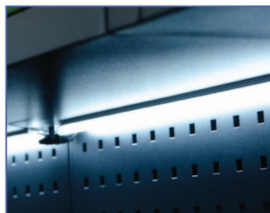
Pegboard back panel with LEDs to illuminate worktop