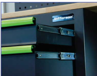
Heavy duty ball-bearing slides on all drawers