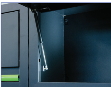
Gas struts on lift-up doors