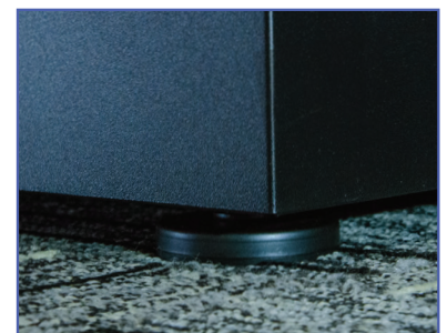
Adjustable feet for levelling on uneven surfaces