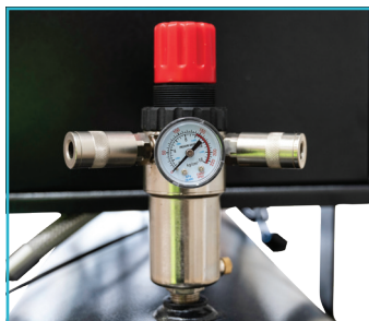
COMES COMPLETE WITH PRESSURE REGULATOR WITH MOISTURE TRAP