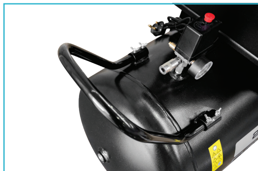
LARGE HANDLE HELPS MAKE IT EASY TO MANOEUVER