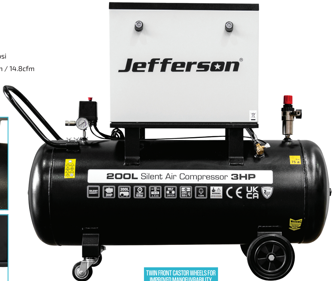
TWIN FRONT CASTOR WHEELS FOR IMPROVED MANOEUVRABILITY